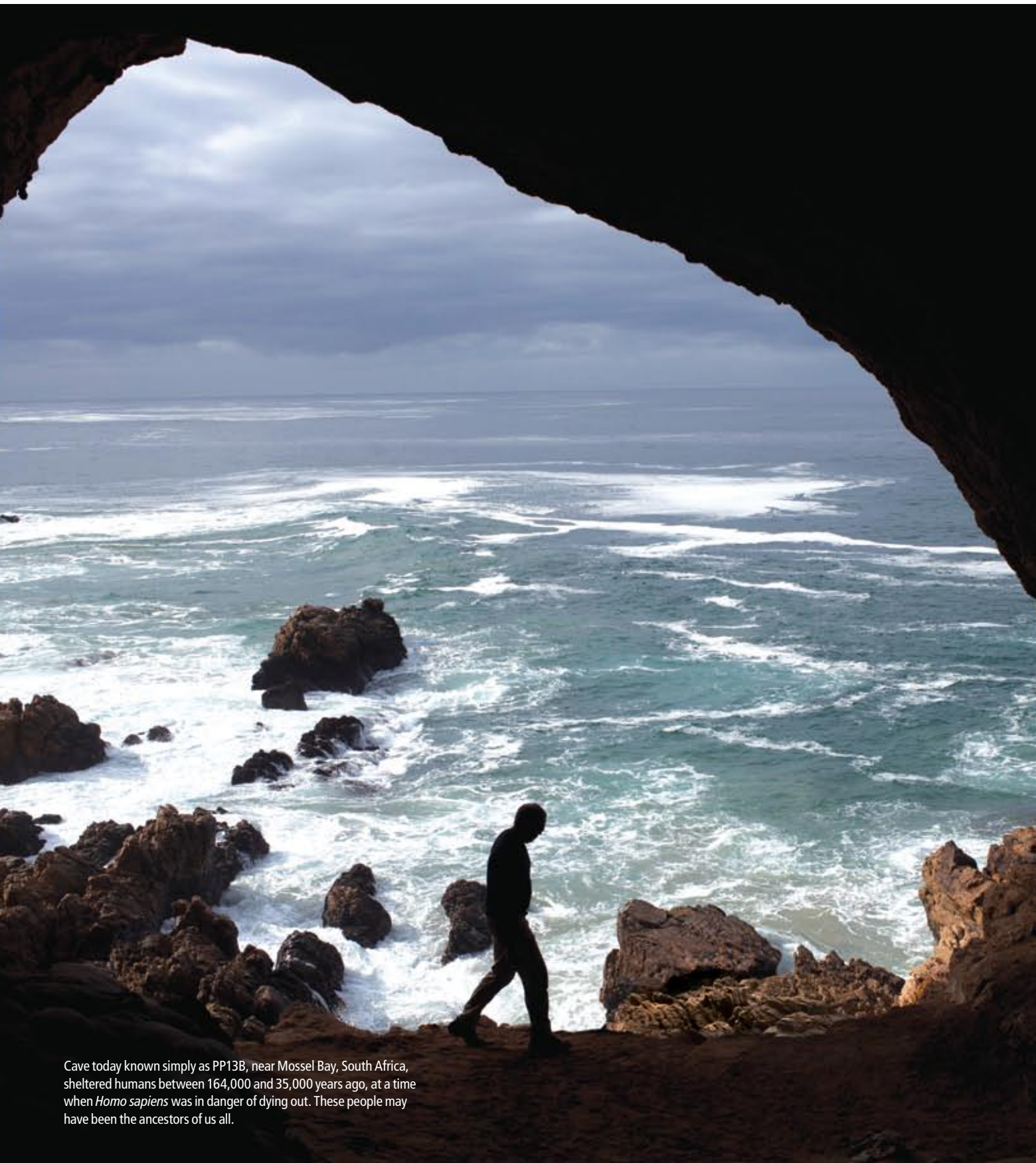
Cave today known simply as PP13B, near Mossel Bay, South Africa, sheltered humans between 164,000 and 35,000 years ago, at a time when Homo sapiens was in danger of dying out. These people may have been the ancestors of us all.